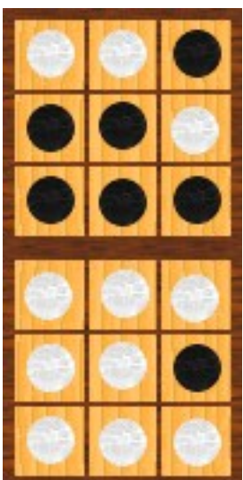
After turn 2: