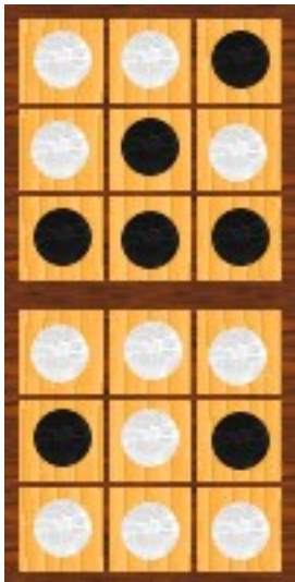
After turn 1: